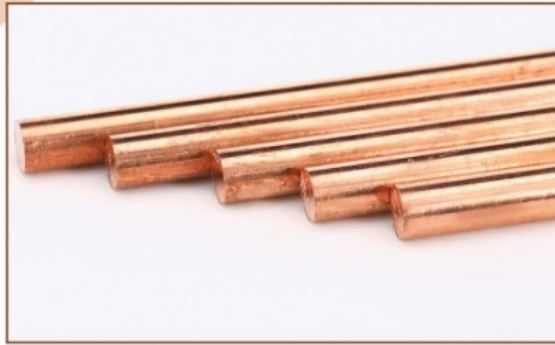
99.9% High Purity Copper 99.9%