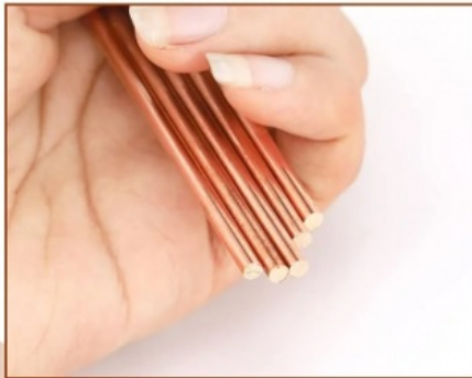
Smooth Copper Surface