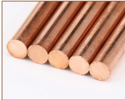
Smooth Cross Section

Widely used in Gear shaft, motor shaft, short support shaft, shaft pocket model, miniature axle, model plane, model ship, model cars